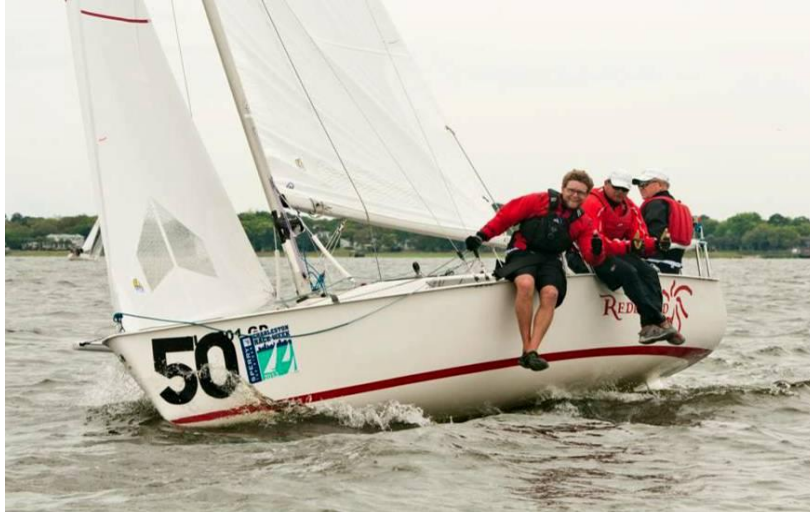
Team Redbeard In Action

Charleston Race Week, known for great wind, challenging current, excellent race management and southern hospitality, really lived up to its reputation this year with 285 boats, over 3,000 sailors and winds that were rarely under 10 knots and frequently over 25.